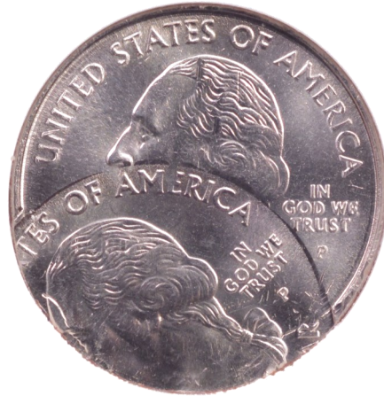
Double Headed Washington Quarter