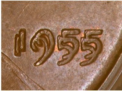
1955 Double Die