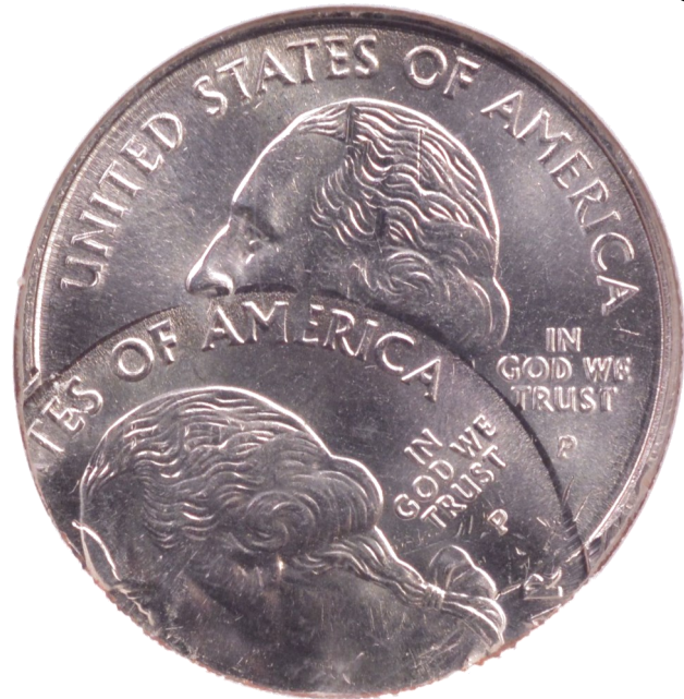
Double Headed Washington Quarter