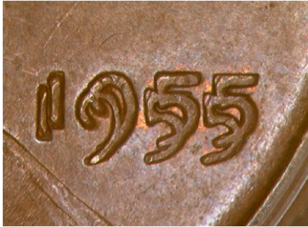
1955 Double Die