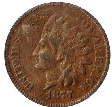
1877 Indian Cent

Last Chance To Pay Your Membership Dues April 8th meeting is the last chance to pay your membership dues or you will lose your club benefits. Membership dues paid after April 8th can be subject to $5.00 late fee.